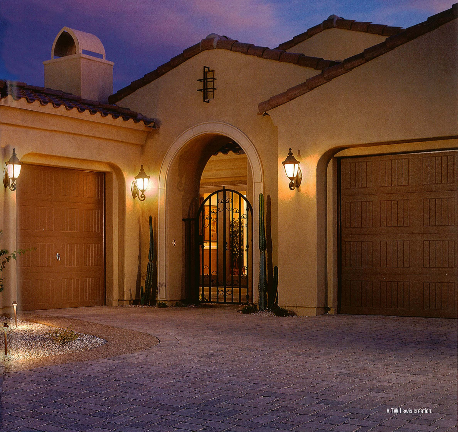
A TW Lewis creation.